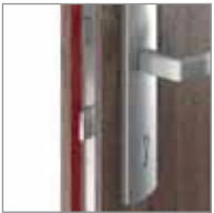
STRIP LOCK Winkhaus multipoint hook-bolt lock