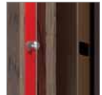
4 ANTI-BURGLARY BOLTS