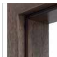
ADJUSTABLE PORTA SYSTEM