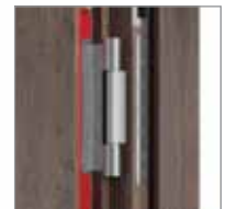
2 INTERNAL HINGES