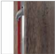
2 ANTI-BURGLARY HOOKS

RC3* entrance door, available in anti-burglary version, intended for buildings. Available in a broad range of sheet metal covering with wood grain laminate coating.