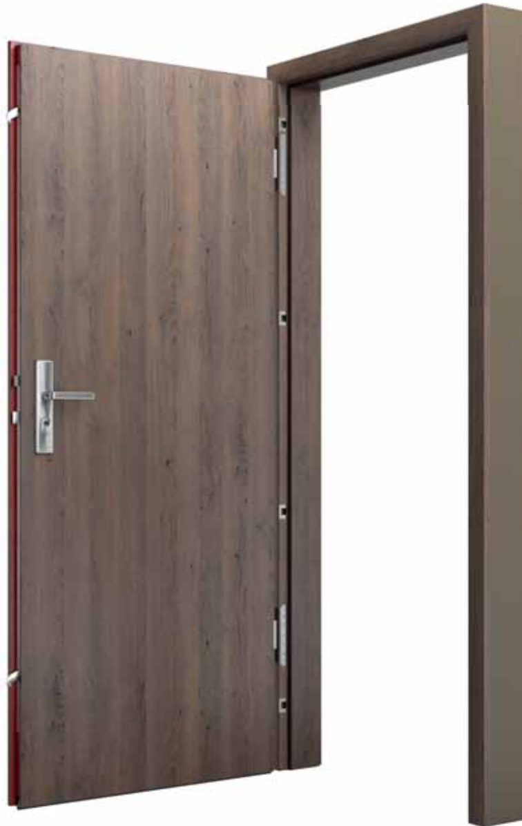
DOOR LEAF THICKNESS 49 MM