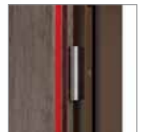
3 THREE-PIECE HINGES