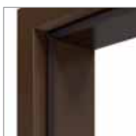
ANGULAR METAL FRAME 100 wide